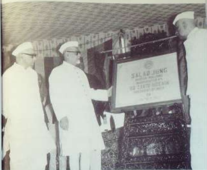
DR. ZAKIR HUSSAIN H.E. PRESIDENT OF INDIA INAUGURATING THE NEW BUILDING OF THE MUSEUM ON 24th JULY, 1968