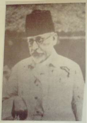
MAULANA ABUL KALAM AZAD

آپ مجھے سادہ رنگ مریخ کے وہی موزوں کے ساتھ کی خوش حاصل ہو کر ایک خاص ذوق نے آنا سامان بہیم بنادیا ہے جو حکومتوں کی گوشوں سے بھی ہمیشہ فراموش ہیں برا کرتا مزید خوش اس بات سے جو کہ عزیزوں کو تقسیم و ترتیب نہایت قابلیت کے ساتھ کی گئی ہے اور اسلئے اشیاف کی حسن نگہداشت اور قضا و شعور اف کرنا پڑتا ہے