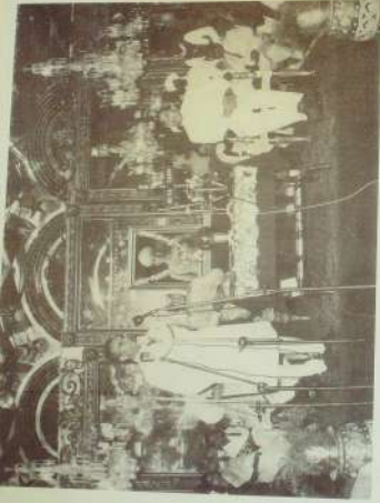
DR. HUMAYUN KASIB UNION MINISTER FOR SCIENTIFIC RESEARCH AND CULTURAL AFFAIRS HANDING OVER THE CHARGE OF THE MUSEUM TO THE SALAR JUNG MUSEUM BOARD, (15 TH JULY 1967).