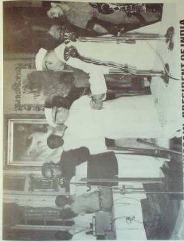
DR. ZAKIR HUSSAIN, PRESIDENT OF INDIA VISIT IN THE OLD BUILDING - 29 TH AUGUST, 1967