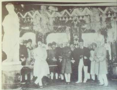
H.E. THE NIZAM VII TH VIEWING THE FAMOUS STATUE VEILED REBECCA AT DIWAN DEODI PALACE WITH PRIME MINISTER SALAR JUNG III AND OTHER NOBLES

दिवान देवडी घराण्याक - मुजब अनावरण प्रयोग गवाम गौर दुबुम जवई घाम आदि या, निजाम (अबुबेक) यावे समवेत पंचमाल सातारजीय कृषीय व अन्य सरदार