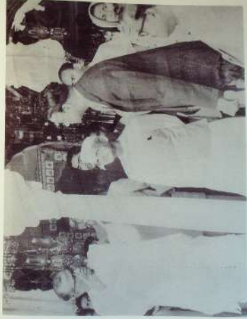
VISIT OF SHEIKH ABDULLAH SAHAB (OLD BUILDING)