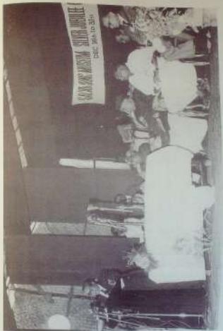
DR. MURUL HASAN, UNION MINISTER FOR EDUCATION, AND DR. K. D. BHARGAVA, M.E. GOVERNOR OF ANDHRA PRADESH ON THE EVE OF THE SALAS YOUNG MUSEUM SILVER JUBILEE CELEBRATIONS - 10th DECEMBER, 1976