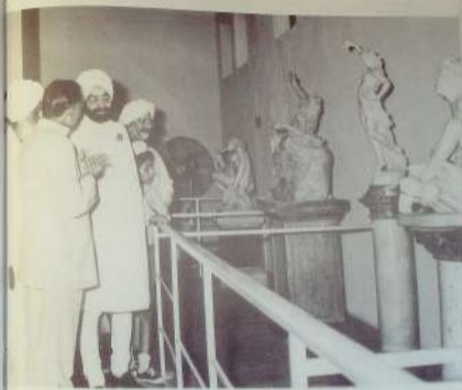
SHRI GHYANI ZAIL SINGH, H.E. PRESIDENT OF INDIA GOING ROUND THE MARBLE GALLERY - 22nd JULY, 1985

ਸ਼੍ਰੀ ਸਿੰਘ Zail Singh 22/7/85 [P.E. PRESIDENT OF INDIA]