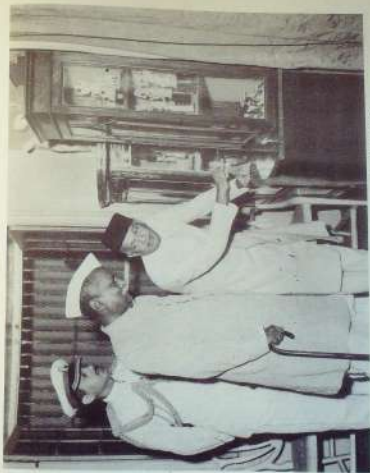
VISIT OF DR. RAJENDRA PRASAD IN THE OLD BUILDING.