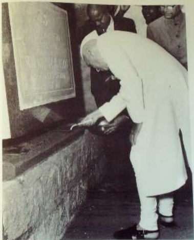
PANDIT JAWAHARLAL NEHRU PRIME MINISTER OF INDIA LAYING THE FOUNDATION STONE TO THE NEW MUSEUM - (23RD JULY 1963)