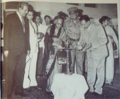
SMT. SARADA MUKHERJEE H.E. THE GOVERNOR OF A.P. INAUGURATING SPECIAL EXHIBITION