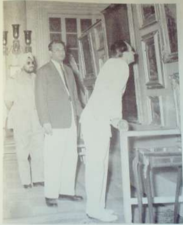
PRINCE AGHA KHAN GOING ROUND THE EUROPEAN OIL PAINTING GALLERY (OLD BUILDING)