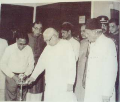
SRI KRISHAN KANT, H.E. GOVERNOR OF A.P INAUGURATING THE EXHIBITION ON THE SALAR JUNGS - FOUNDERS OF THE MUSEUM ON 27TH MARCH, 1994