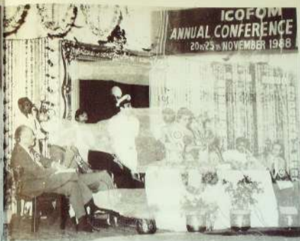
MR. KUNIND SEN JOSHI N.E. THE GOVERNOR OF A.P. INAUGURATING ICOFORM ANNUAL CONFERENCE 20TH NOV. 1988.