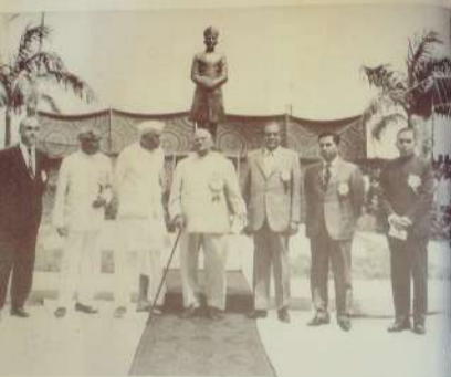
SHRI V. V. GIRDHAR, N.E. PRESIDENT OF INDIA ALONG WITH SHRI KHANDUBHAI K. DESAI, GOVERNOR OF ANDHRA PRADESH AND OTHER SALAR JUNG MUSEUM BOARD MEMBERS AFTER UNVEILING THE STATUE OF SALAR JUNG-III (25TH SEP. 1973)