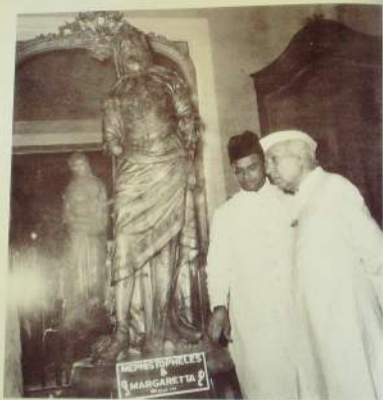
PANDIT JAWAHARLAL NEHRU PRIME MINISTER OF INDIA ON THE EVE OF THE NEW BUILDING FOUNDATION LAYING CEREMONY - 23rd JULY, 1963