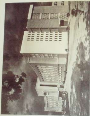
NEW BUILDING VIEW - JULY 1968