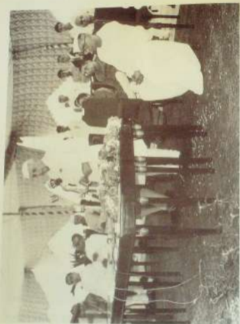
PANDIT JAWAHARLAL NEHRU PRIME MINISTER OF INDIA ON THE EVE OF THE NEW BUILDING FOUNDATION LAYING CEREMONY 23RD JULY, 1963