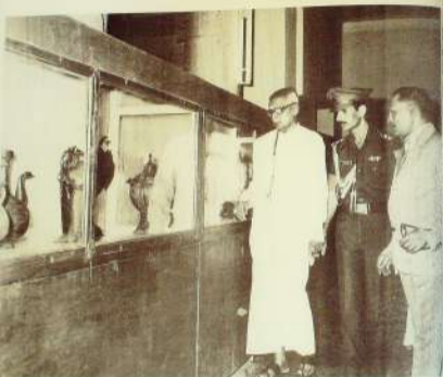
SHRI K.C. ABRAHAM N.E. GOVERNOR OF ANDHRA PRADESH GOING ROUND THE TEMPORARY EXHIBITION AFTER THE INAUGURATION.