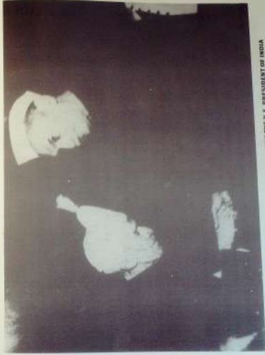
H. E. H. THE NIZAM VII RAJ PRASAD RECEIVING THE H. E. PRESIDENT OF INDIA DR. RAJENDRA PRASAD AT HYDERABAD AIR PORT.

S. Radhakrishnan — (Vice-President of India)