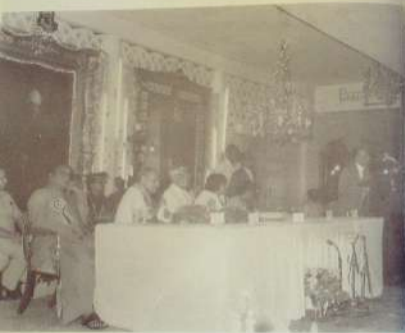
INAUGURATION OF THE BIRTH CENTENARY OF SALAR JUNG-III SHRI R. VENKATRAMAN VICE-PRESIDENT OF INDIA, SMT. KUMUDDEN JOSHI H.E. THE GOVERNOR OF A.P. SHRI P. V. NARSIMHA RAO, HON'BLE MINISTER FOR H.R.D. AND DR. N.T. RAMA RAO, HON'BLE CHIEF MINISTER OF A.P. (1986)