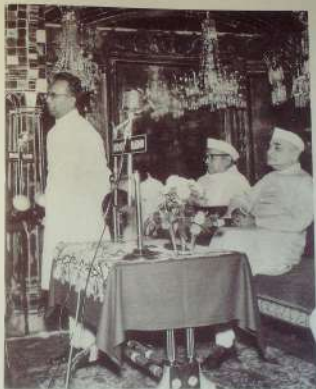
DR. BHIMSEN SACHAR H.E. GOVERNOR OF A.P. & DR. HUMAYUN KABIR UNION MINISTER FOR CULTURAL AFFAIRS ON THE EVE OF INAUGURATION OF LIBRARY (1968)