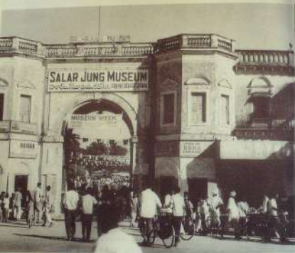
ENTRANCE OF THE OLD MUSEUM DIWAN DEODI.