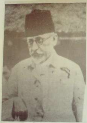
MAULANA ABUL KALAM AZAD

آپ مجھے سادہ رنگ مرقوم کے وہی بیوز لم کے سامنے ایک خوش حال سرور ایک ٹھکانے دوق نہ آتا سا مان بہیم بنادیا ہے جو حکومتوں کی گوشوں سے بھی ہمیشہ فراموش ہیں ہوا کرتا۔ مزید خوش اس بات سے ہوا کہ بیوزوں کو تقسیم و تہ تیغ نہایت قابلیت کے ساتھ کی گئی ہے اور ایسے اشیاف کی حسن کارگزاری کیا اعراف کرنا پڑتا ہے