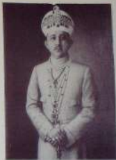
NAWAB MIR YOUSUF ALI KHAN SAHAUR SALARJUNG III (1889 - 1940)