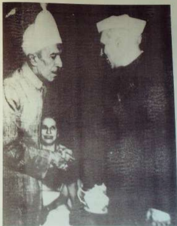
H.E.H. THE NIZAM-VII RAJ PRAASHUKH RECEIVING PRIME MINISTER SRI PANDIT JAWAHARLAL NEHRU AT THE AIR PORT